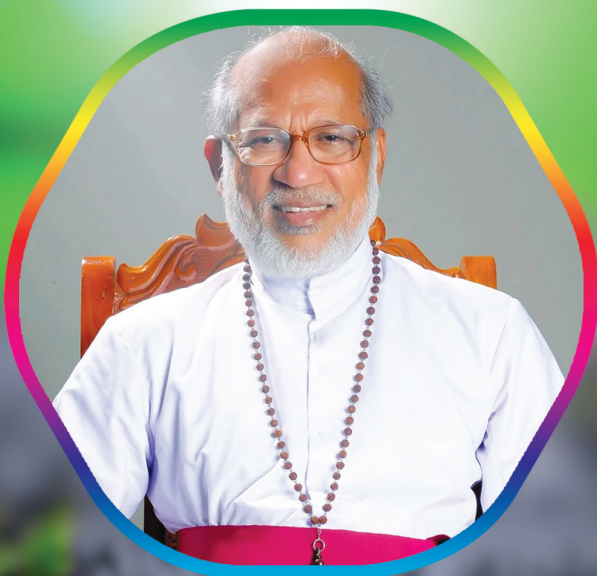
HIS BEATITUDE MAR GEORGE CARDINAL ALENCHERRY Major Archbishop of Syro Malabar Major Episcopal Church