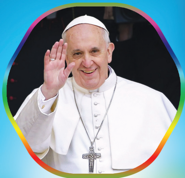
HIS HOLINESS POPE FRANCIS