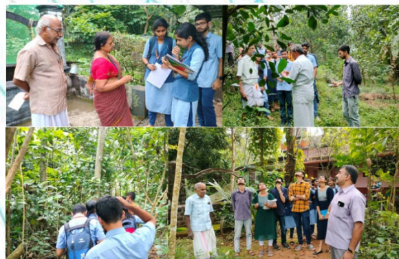
Relevant Pictures of Biodiversity Club members of the college taking part in a Biodiversity survey for the renewal of Biodiversity Register of Ramapuram Grama Panchayath held in December 2022.

was to highlight and honor the pupils' artistic abilities. Over 180 students participated enthusiastically in a variety of events during the one-day program, including light music, Mohiniyattam, mime, and other activities.