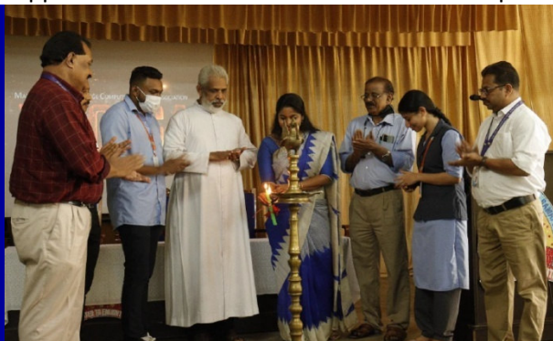
Launch of MACCS A The first day of MACCS A events

Overall, the media visit organized by the Department of English at Mar Augusthinose College, Ramapuram was a resounding success. It provided the students with valuable exposure to the media industry and equipped them with practical knowledge that will be beneficial for their future careers. The Department of English is committed to providing such experiential learning opportunities to enhance the educational experience of its students.