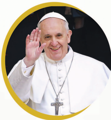
HIS HOLINESS POPE FRANCIS